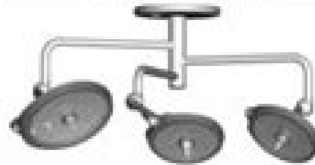
LED785/585/585 Triple Lighthead System