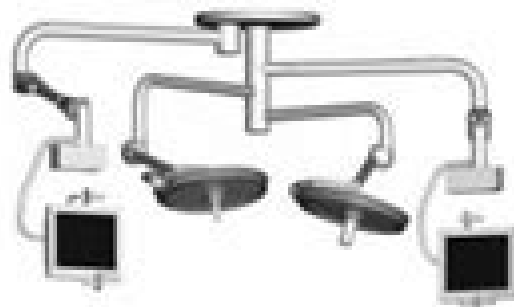
LED585/585 with two Single Flat Panel Monitors