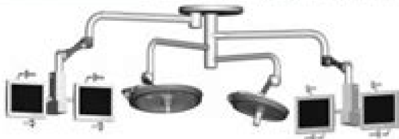
LED785/585 with two Dual Flat Panel Monitors