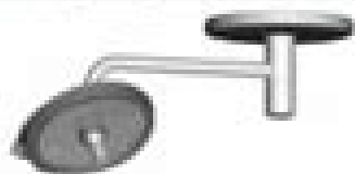
LED585 Single Lighthead System