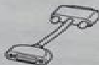
Adaptador de DVI a VGA