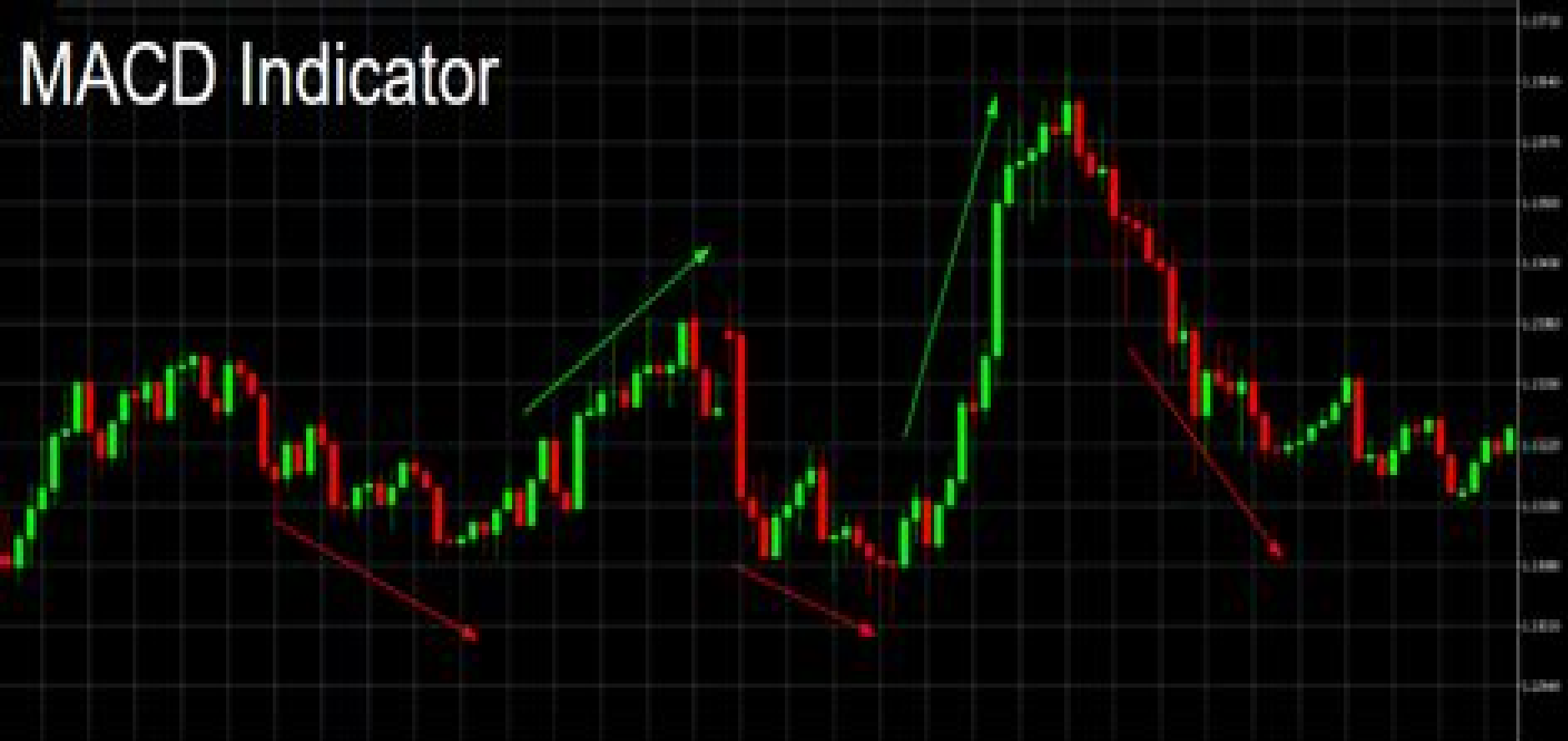
MACD Indicator Window