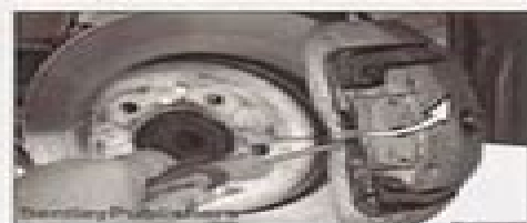
Detailed brake pad and rotor service. 340 Brakes