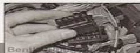
Extensive electrical component location information. ECL Electrical Component Locations