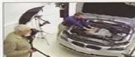
Bentley technical editors removing motor cover on V8 (N62) engine.

The do-it-yourself BMW owner will find this manual indispensable as a source of detailed maintenance and repair information. Even if you have no intention of working on your vehicle, you will find that reading and owning this manual makes it possible to discuss repairs more intelligently with a professional technician.