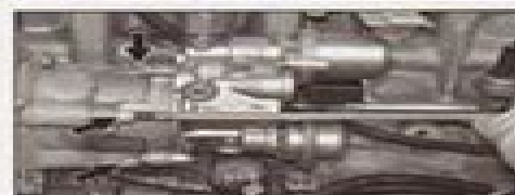
Servicing the high-pressure fuel system on turbo models, including replacing HPFI fuel pump. 560 Fuel Tank and Fuel Pump