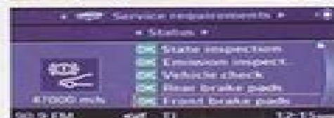
Learn how to reset condition-based service (CBS) intervals. 520 Maintenance