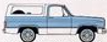
Available Special Two-Tone in Light Blue/Hot White Combina- tion