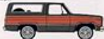
Available Exterior Decor Package in Midnight Black/Apple Red Combination

Available Exterior Decor Package. Choose from 14 two-tone color combinations. Includes moldings and lamp trim in special two-tone scheme, plus dual-tone decal striping on body sides and across the rear of the vehicle. Accent color is applied on body sides and rear between striping and moldings. Includes a stand-up hood emblem on gasoline models.