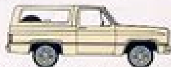
Standard Solid Color Paint (Fog White Handled and Cab Roof used with Light Blue & Apple Red)

Available Special Two-Tone Scheme. Includes body side and rear moldings, bright wheel-opening moldings, bright side marker and tailamp trim. Accent color is applied below moldings.