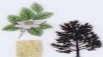
Pacific Dogwood Cornus nuttallii D 1"; H 50" LV 2.5"-4.5" L x 1"-2.5" W; R 0"-6000"