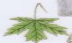
Bigleaf Maple Acer macrophyllum D 3"-4"; H 30"-70" LV 6"-10" L x 6"-10" W; R 0"-10,000"