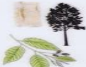
White Alder Alnus rhombifolia D 2"; H 60" LV 2"-3.5" L x 1.5"-2" W; R 0"-5000"