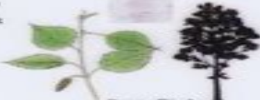
Paper Birch Betula papyrifera D 24"; H 100" LV 1.5"-3" L x 2" W; R 0"-5000"