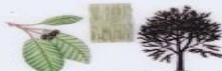
Castanea Buckthorn Rhamnus parviflora D 1"; H 30" LV 2"-6" L x 1"-2.5" W; R 0"-5000"