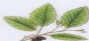
Red Alder Alnus rubra D 2"; H 50"-100" LV 3"-5" L x 2"-3" W; R 0"-2500"