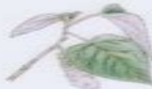
Black Cottonwood Populus trichocarpa D 1"-3"; H 60"-120" LV 3"-6"; R 0"-9000"