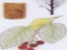
Common Chokecherry Prunus virginiana D 6"; H 20" LV 1"-3" L x 0.5"-1.5" W; R 0"-8000"