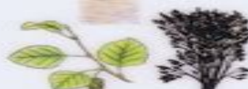
Water Birch Betula occidentalis D 6"-12"; H 30" LV 1"-3" L x 1" W; R 2000"-8000"