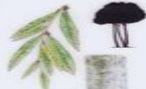
Pacific Waxmyrtle Myrica californica D 1"; H 30" LV 2"-4" L x 0.75" W; R 0"-500