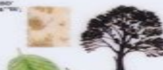
Pacific Madrone Arbutus menziesii D 1.5"; H 60" LV 2"-6" L x 1"-2.5" W; R 0"-5000"