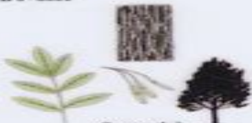
Oregon Ash Fraxinus latifolia D 2"; H 80" LV 2"-5" L x 1"-1" W; R 0"-5000"