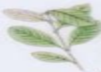
Scouler Willow Salix scouleriana D 1"-2"; H 20"-50" LV 2"-5" L x 0.5"-1.5" W; R 0"-10000"