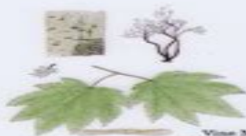
Vine Maple Acer circinnatum D 8"; H 25" LV 2"-4" L x 2"-4" W; R 0"-5000"

C—Cone D—Diameter H—Height LV—Leaves LV—Length N—Needles R—Range W—Width