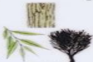
Pacific Willow Salix lasioandra D 2"; H 30"-50" LV 2"-5" L x 1" W; R 0"-8000"