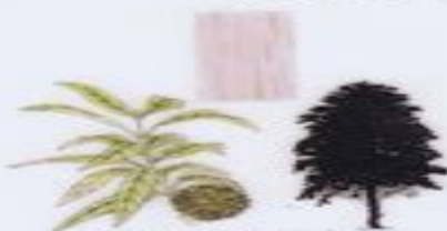
Golden (Giant) Chinquapin Castanopsis chrysophylla D 1"-3"; H 60"-100" LV 2"-5" L x 1.5" W; R 1"-6000"