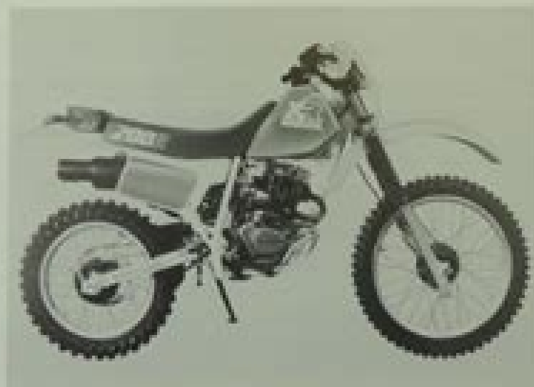
1986 MODEL SHOWN, 1987 MODEL SIMILAR

SETUP AND PREDELIVERY SERVICE MUST BE PERFORMED BY AN AUTHORIZED HONDA MOTORCYCLE DEALER. Proper setup and pre-delivery service is essential to rider safety and reliability of the motorcycle. An error or oversight made by the mechanic performing and verifying a new unit can easily result in faulty operation, damage to the machine, or even injury to the rider.