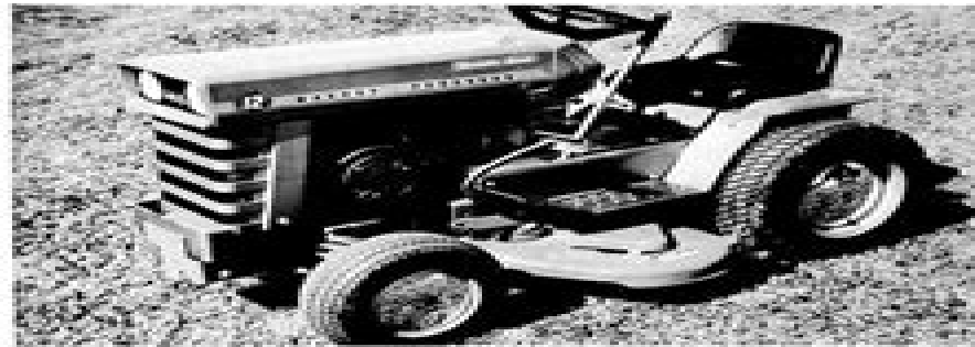
MF 12 G LAWN AND GARDEN TRACTOR