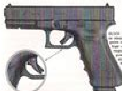
GLOCK MB Ambidextrous magazine release

The configuration of the model is provided by the "GLOCK" logo on the slide. The logo is located on the slide of the handgun. The logo is located on the slide of the handgun.