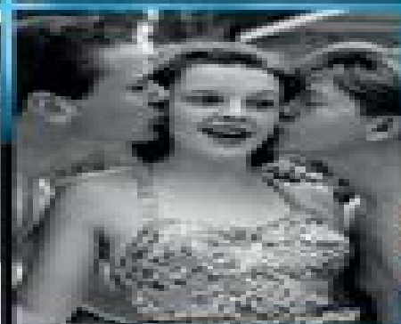
Judy Garland (with Robert Taylor & Mickey Rooney)