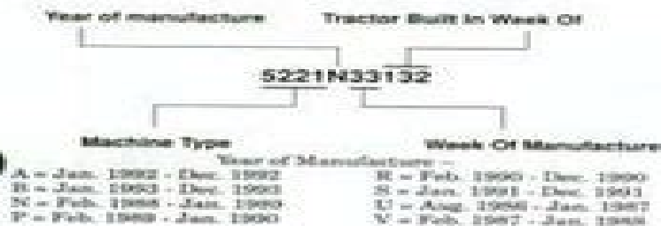
Fig. 3—The tractor serial number identifies machine type, year of manufacture, week of manufacture during specific year, and specific unit manufactured during that week. The illustration shown identifies a two-wheel-drive 360 tractor which was the 132nd tractor manufactured during the 33rd week of 1988.