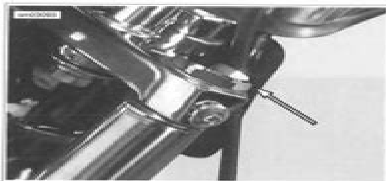
Figure 2-76. Fork Tube Cap