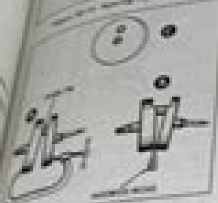
FOR THE RECORD