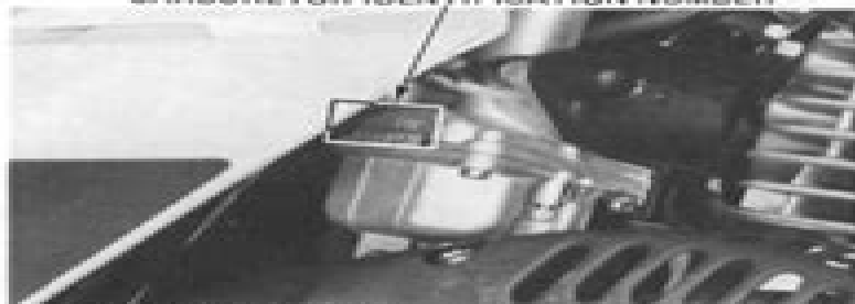
CARBURETOR IDENTIFICATION NUMBER

The carburetor identification number is on the carburetor body right side.