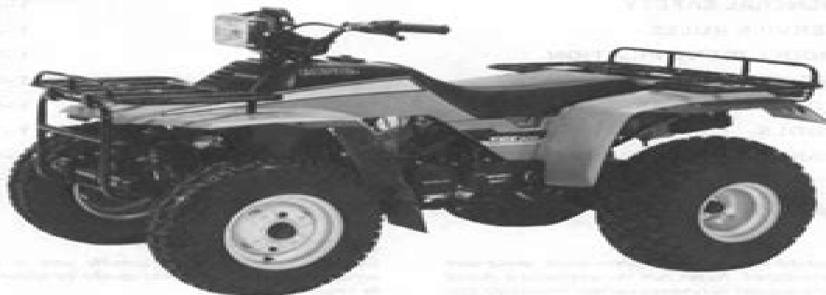
FRAME SERIAL NUMBER