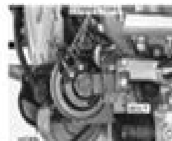
Fig. 10-20-106 Remove the cam chain tensioner after test and timing marks.

Remove the cam chain tensioner after test and timing marks.