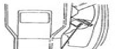
VEHICLE IDENTIFICATION NUMBER (VIN)

The carburetor identification numbers are stamped on the carburetor bodies.