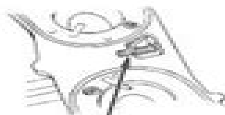
CARBURETOR IDENTIFICATION NUMBER

The engine serial number is stamped on the rear right side of the engine case.