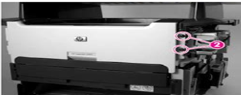
Figure 5-30 Remove the convenience-stapler assembly (2 of 2)