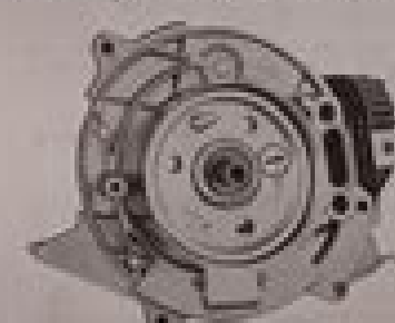
Figure 14 Correct Brake Plate Position

NOTE: Arrow on Brake Plate must point toward exhaust ports (Fig. 14).