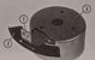
Figure 12 Clutch/Brake Unit Pre-assembly

STEP 43 Pre-assemble the Actuator & Arm into the Clutch/Brake Housing. Then position the Actuator Shaft into the Arm as shown in Fig. 10.