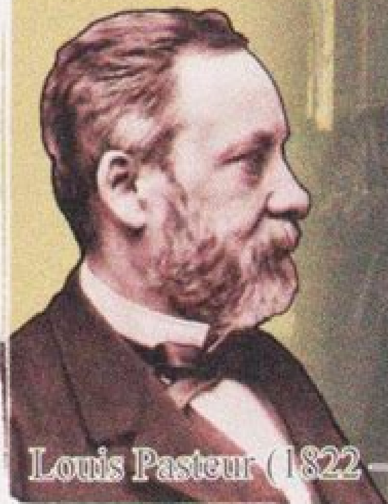
Louis Pasteur (1822 – 1895)