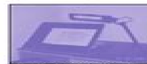
Reading Stand with overhead reading lamp