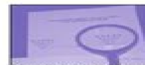
Hand Held Magnifier