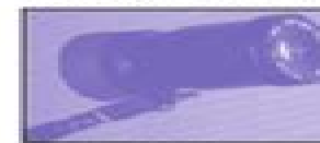
Hand Held Telescope