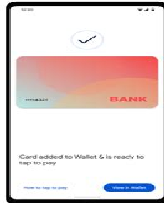
6. Success screen