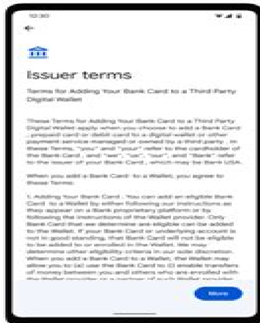
4. Accept issuer ToS