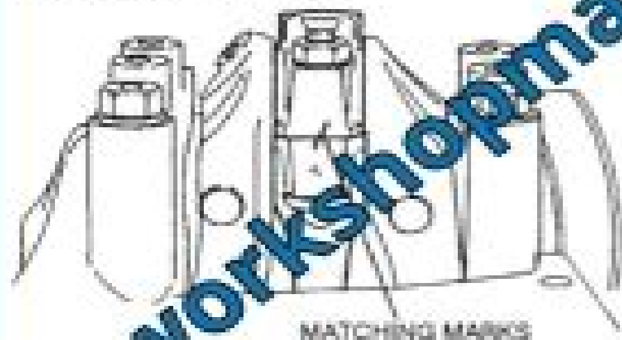
Fig. 10. Aligning Landing Marker On Contouring Rail & Cap Component of A-1. (See Section 4.5.1 for details.)