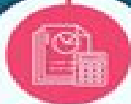
Figure out the cost of your proposed project early .