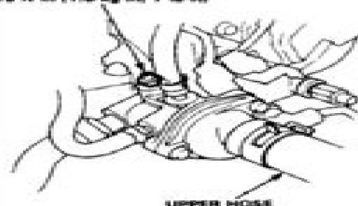
BLEED BOLT 10 N·m (1.0 kg-m, 7 lb-ft)