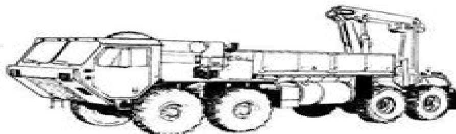
LEFT FRONT VIEW