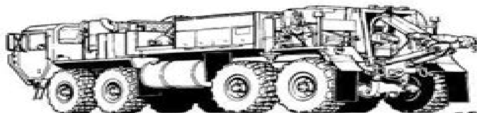
LEFT REAR VIEW