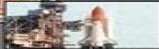
NASA Launch Pad

JAB's CONSTRUCTION, COST ESCALATION, COST ENGINEERING, CONSTRUCTION MANAGEMENT, COST CONTROL, CHANGE ORDERS, PLANNING AND SCHEDULING, CRITICAL PATH METHOD (CPM), PROGRAM EVALUATION REVIEW TECHNIQUES (PERT)