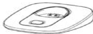
KX-TG6411CS/T (Base Unit)