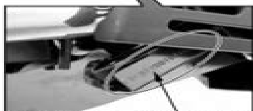
Location of Frame Serial Number