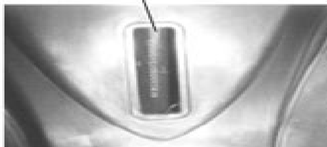
Location of Frame Serial Number