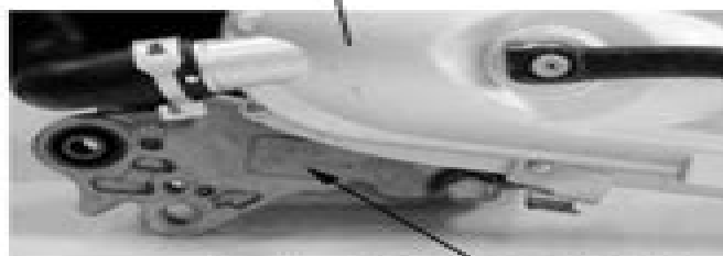
Location of Engine Serial Number