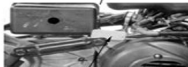
Location of Engine Serial Number