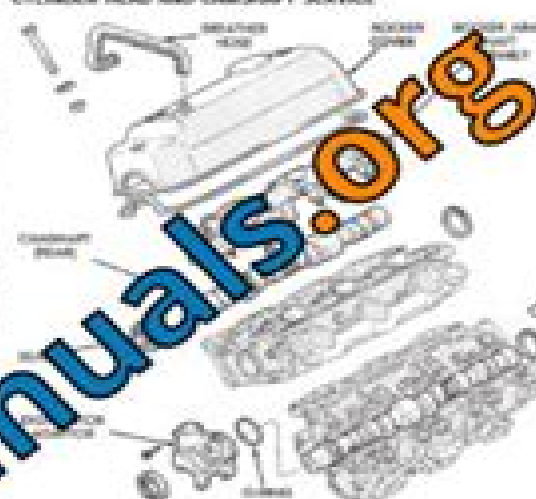
Fig. 1 Cylinder Head/Camshaft Valves