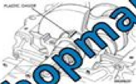
Fig. 4 Measure Crankshaft Journal O.D.

CAUTION: Do not rotate crankshaft or the plunger will be damaged.