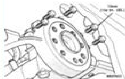
Fig. 3 Rear Seal Assembly