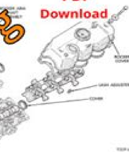
Fig. 2 Rocker Cover