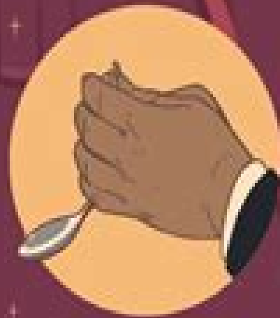
The Spoon Bend