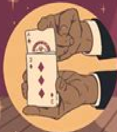
The Rising Card