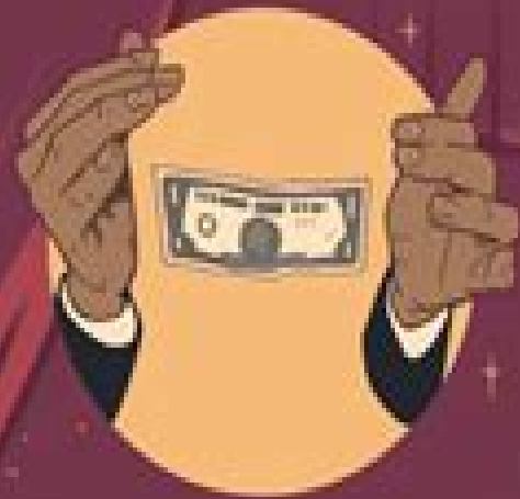
The Levitating Dollar