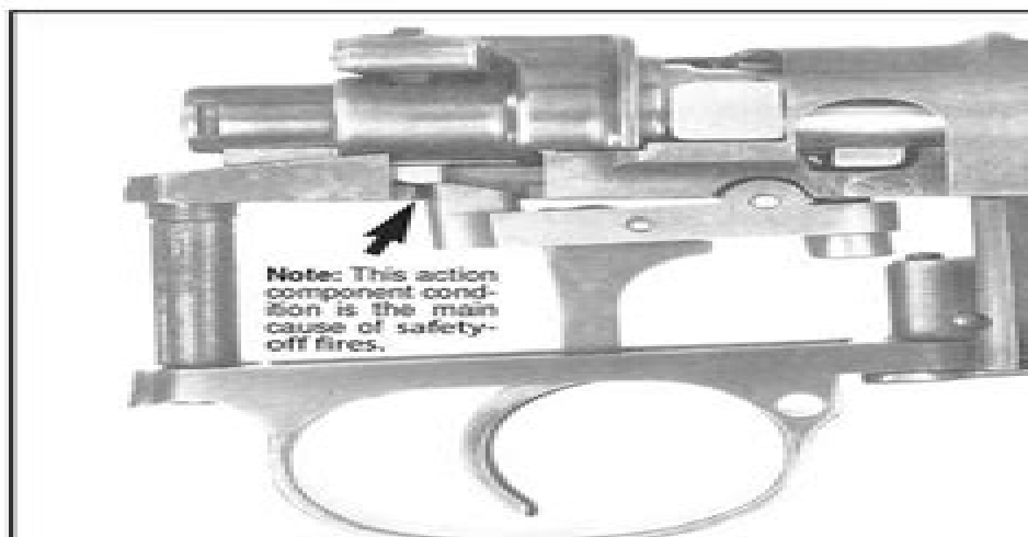
Figure 48- Shows the trigger sear in a cutaway M98 action blocked by cocking piece ledge overtravel that occurred when the trigger was cycled while the safety lever was in the safe position. This condition was caused by an altered top cocking piece safety lever engagement corner which reduced cocking piece/trigger clearance to less than zero. Note that this disconnects and blocks the trigger sear.