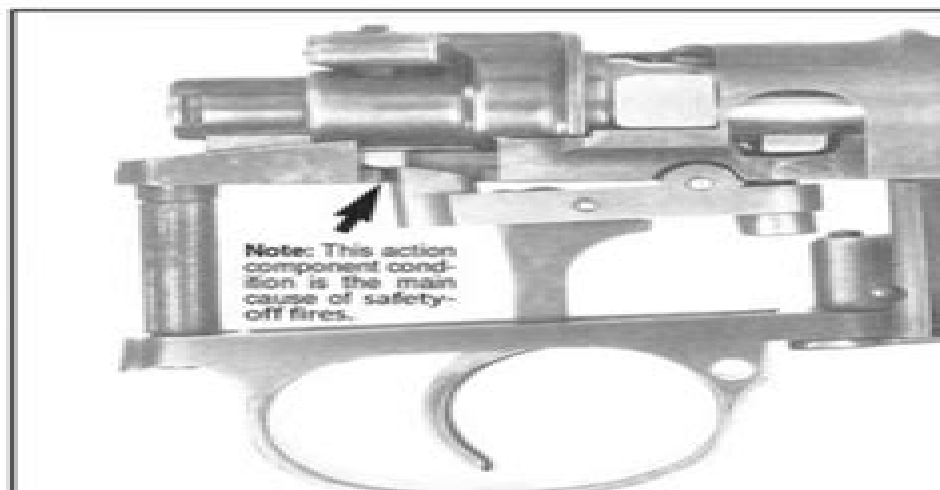
Figure 48- Shows the trigger sear in a cutaway M98 action blocked by cocking piece ledge overtravel that occurred when the trigger was cycled while the safety lever was in the safe position. This condition was caused by an altered top cocking piece safety lever engagement corner which reduced cocking piece/trigger clearance to less than zero. Note that this disconnects and blocks the trigger sear.