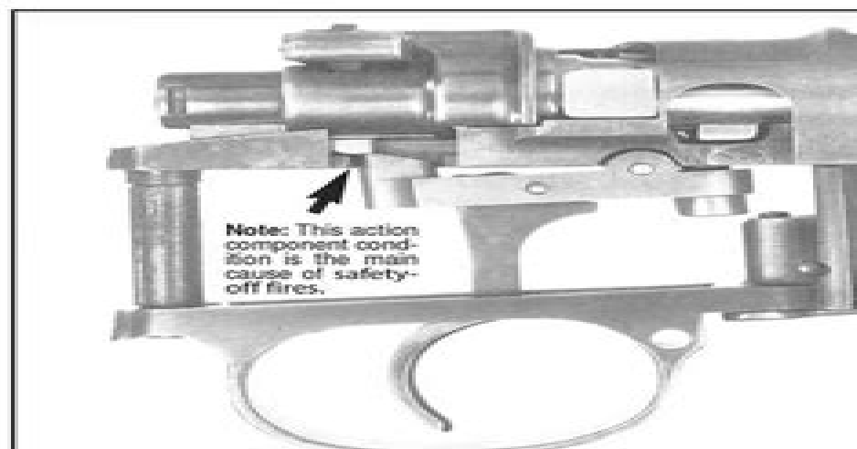
Figure 48- Shows the trigger sear in a cutaway M98 action blocked by cocking piece ledge overtravel that occurred when the trigger was cycled while the safety lever was in the safe position. This condition was caused by an altered top cocking piece safety lever engagement corner which reduced cocking piece/trigger clearance to less than zero. Note that this disconnects and blocks the trigger sear.