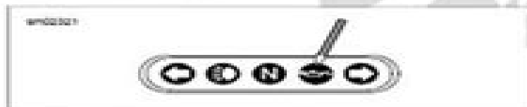
Figure 3-8. Oil Pressure Indicator Lamp

To troubleshoot the problem, always check the engine oil level first. If the oil level is OK, determine if oil returns to the oil pan. If oil does not return, shut off the engine until the problem is located and corrected.