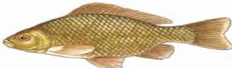
31. Crucian Carp Carassius auratus 10-30 cm