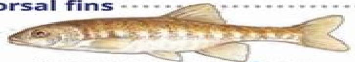
32. Minnow Phoxinus phoxinus 8-12 cm