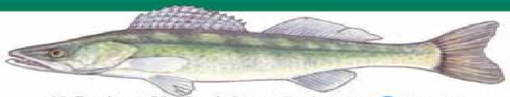
25. Zander or Pike Perch Stizostedion lucoperca 45-125 cm