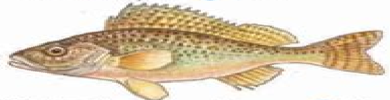
29. Ruffe or Pope Gymnocephalus cernuus 10-20 cm