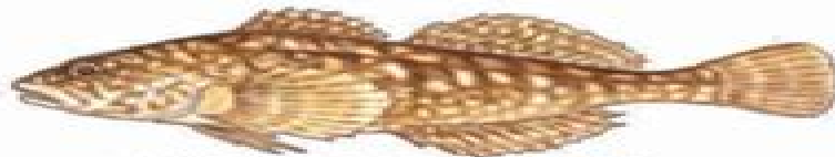
28. Bullhead Cottus gobio 8-12 cm