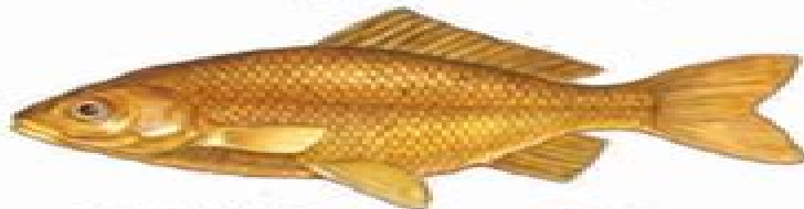
33. Goldfish Carassius auratus 25-40 cm