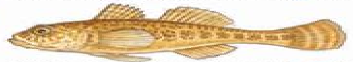
30. Common Goby Pomatoschistus microps 4-12 cm