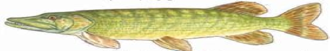
35. Pike Esax lucius 50-150 cm