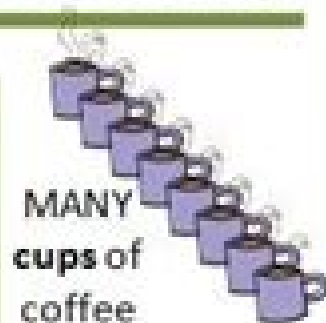
MANY cups of coffee

How many cups of coffee do you drink per day?