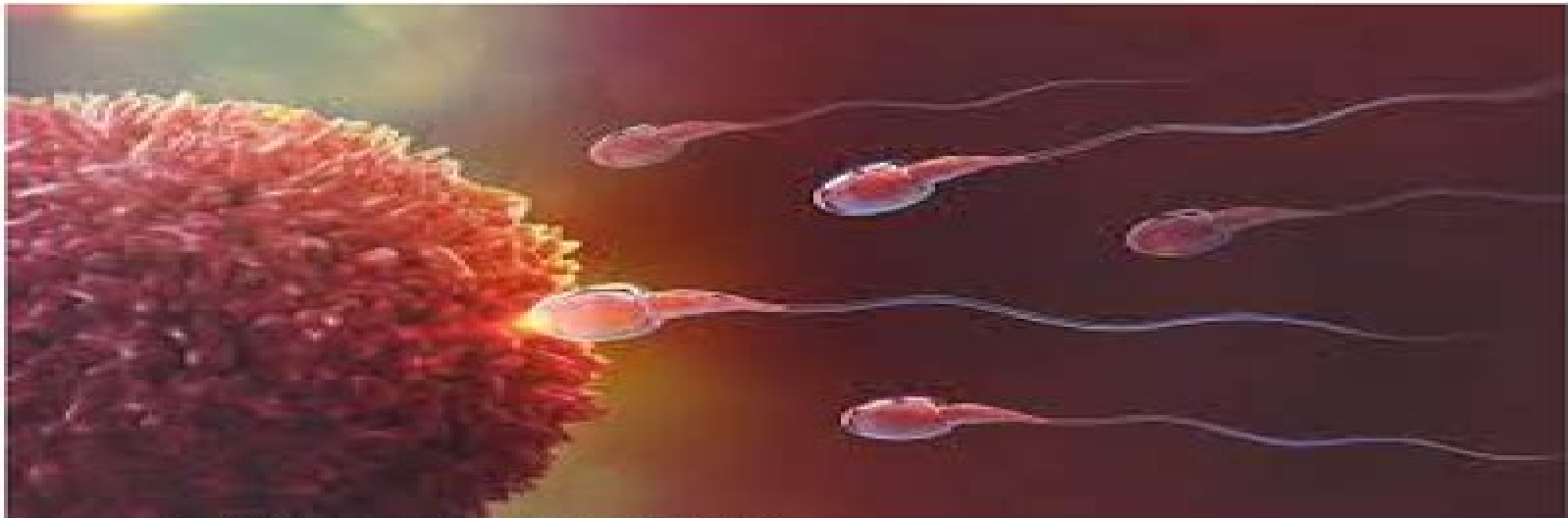
Figure 1 - Human reproduction and fertilization (2021)