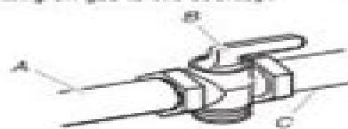
A. Gas supply line B. Shutoff valve "open" position C. To cooktop

The supply line must be equipped with a manual shutoff valve. This valve should be located in the same room but external to the cooktop enclosure or cabinet. It should be in a location that allows ease of opening and closing. Do not block access to shutoff valve. The valve is for turning on or shutting off gas to the cooktop.