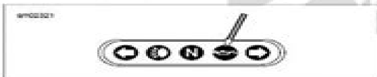
Figure 3-8. Oil Pressure Indicator Lamp

To troubleshoot the problem, always check the engine oil level first. If the oil level is OK, determine if oil returns to the oil pan. If oil does not return, shut off the engine until the problem is located and corrected.