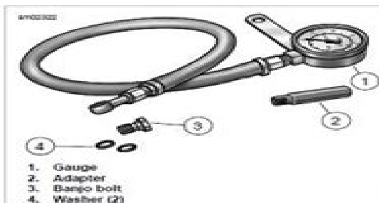
Figure 3-10. Oil Pressure Gauge Set