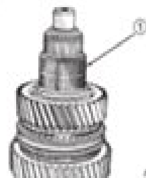
Fig. 19 THIRD GEAR BEARING

(25) Install third gear needle bearing on shaft (Fig. 19).