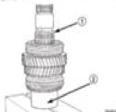
Fig. 16 SECOND GEAR BEARING

(21) Install second gear needle bearing on shaft (Fig. 16).