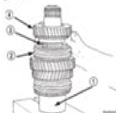
Fig. 17 SECOND GEAR

(22) Install second gear onto shaft and bearing (Fig. 17). Verify second gear is seated on thrust washers.