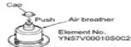
Bleeding internal pressure of tank