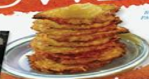
Latkes PAGE 373