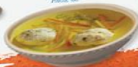
Shtetlel Mushroom Matzo Balls PAGE 68