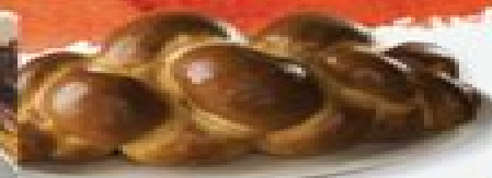
Mama Hinda's Challah PAGE 328