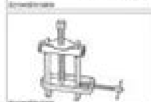
Fig. 2 Specialized Puller Set