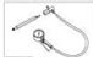
Fig. 4 Compression Tester