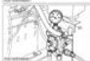
Fig. 2 Air Filter