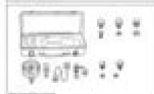
Fig. 5 Oil Pressure Tester