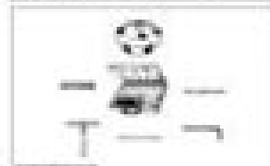
Fig. 3 Valve Seat Cutter Set