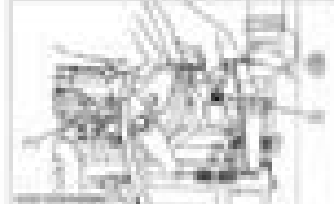
Fig. 4 Valve Train