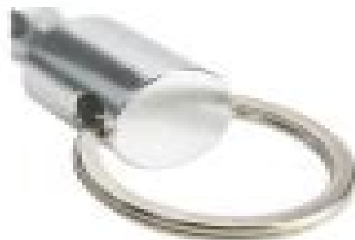
Below is the end, the bearing is an important component of the Kubotan.