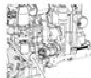
Engine Oil Filter