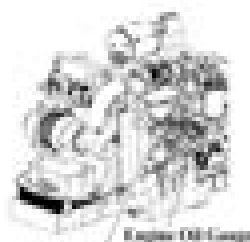
Engine Oil Pump

For temperatures below 32°F use SAE 10W.