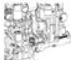
Engine Oil Filter