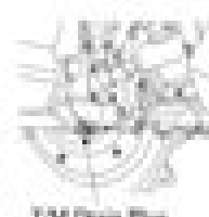
T/M Drain Plug