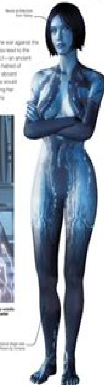
Head (part of armor)