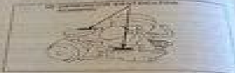
2-2 SIDE VIEW

The front view is shown in the right side of the drawing.