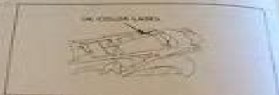
4-4 SIDE VIEW

The front view is shown in the right side of the drawing.