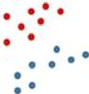
PCA projection: Maximising the variance of the whole set